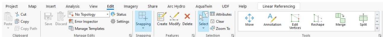
Figure 3: ArcGIS Pro editing toolbar.

Here is a link to an overview of ArcGIS editing tools: Editing in ArcGIS Pro—ArcGIS Pro | Documentation .