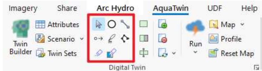
Figure 2: AquaTwin editing tools.

Here is a link to the AquaTwin online help guide for more information: Manually Editing Assets in AquaTwin .